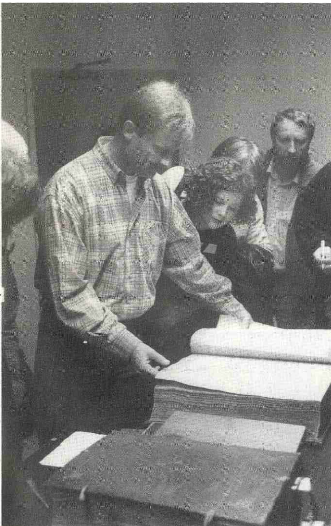
Sixteenth century herbaria, Leiden.

To reach the exhibition one has to pass the aquarium, and this again was 'something else'. There were upwards of forty marine tanks, some of them large, and all the animals in them seemed in excellent health. Apart from a plethora of fish, including moray eels, there were