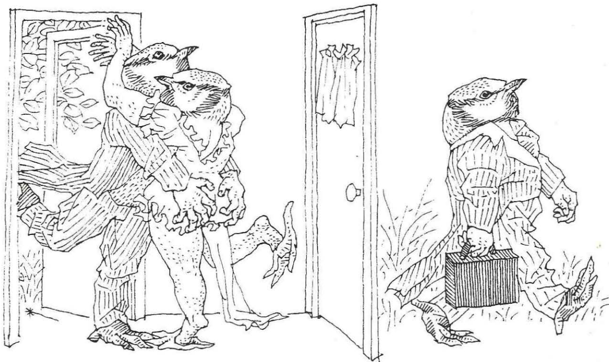
Illustration depicting the "cuckholding" behaviour of blue tit females, who sometimes have one of their eggs fertilised by an older male. [From the Catalogue of Temporary Exhibition entitled 'Fakes, frauds and deception' at the Amsterdam Zoological Museum.]