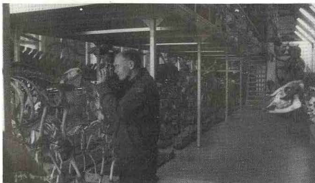
"In his minds eye he could see herds of Wildebeest roaming across the African plains" Osteological storage, Amsterdam.

The evenings were our own, so we explored the delights of the city of Amsterdam. We tried many things; beer, pool, table football!! We even visited the Sex Museum (and the Erotic Museum - Ed), for purely professional reason, of course. The labels were easily