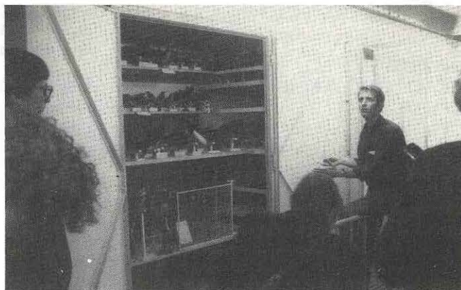
Mounted bird storage, Leiden

understandable (at least I think there were labels!). There were lots of photographs, displayed using a variety of mounting techniques. There were also one or two exhibits of human dummies that I can't remember seeing in the latest Gems catalogue! The audiovisual exhibits were fairly eye catching. And all done in the best possible taste; well nearly. This should be an interesting one if they go for MGC Registration!