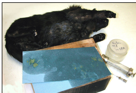
freeze-dried cat showing the lipid-soaked paper towels and the greasiness of the ventral fur

Although this technique is still ongoing, it is working well combining fat removal with mothproofing. Any further developments, including problems, will be reported in later issues.