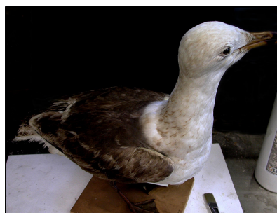
Successful completion of the work leading to a much cleaner bird