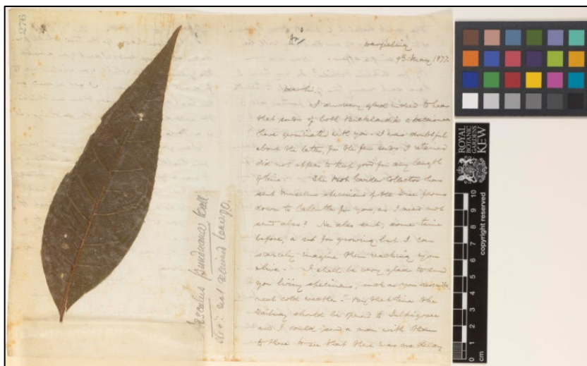
Fig. 5. A typical digitised letter from James Alexander Gammie to Sir Joseph Dalton Hooker; from Darjeeling, India, 1877 (Gammie, 1877). Copyright RBG Kew.

Each volume is indexed and catalogued through a database constructed in Microsoft Access . At this stage each letter is given a unique identification number allowing us to track its progress throughout the digitisation process. The letters are imaged using either flat bed scanners ( EPSON 10000XL ) or a digital camera ( Cambo camera with a 56mp, Leaf Aptus-II 10 AFD digital back). Images are edited in Adobe Photoshop and include a ruler for scale and a colour chart for colour standardisation (fig. 5). A quality check is carried out on every tenth image to examine the focus and lighting against defined standards. High quality 300 dpi (dots per inch) TIFF images are produced and stored on external hard drives.