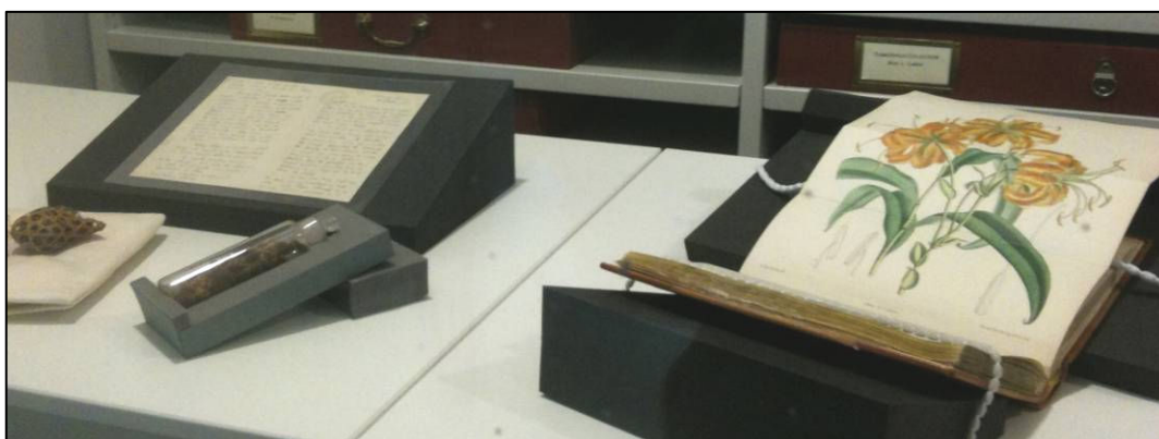
Fig. 6. Part of a reading room display related to A. Henry depicting (left) rhizomes in small baskets and roots of Coptis teeta in a glass jar with a letter discussing the plants cultivation, and (right) an illustration of Lilium henryi from Curtis' Botanical Magazine, 1891.

In 1882 Henry was assigned to Yichang (then Ichang), China as a customs official (O'Brien, 2011b). He became interested in the plant-derived medicines that passed through his customs house and made early collecting excursions into the Yichang Mountains and along the Yangtze River into Sichuan. As well as medicinal plants Henry was engaged by plants of economic value, including the varnish or Chinese lacquer tree, Rhus verniciflua ( Toxicodendron vernicifluum ) whose sap is used as a high quality varnish. Henry sent seeds of the varnish tree with one of his first letters to Kew hoping it would be of interest as an economic product (Henry, 1885). At a later date Henry sent examples of the tools used by local cultivators to harvest the varnish: a knife to make an incision in the trunk and mussel shells, which were inserted into the tree to collect the sap (Henry, 1889). We were able to exhibit these tools alongside other items of economic botany and Henry's letters.