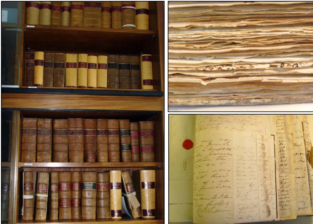
Fig. 3. Clockwise from left: the original leather bound DC volumes; detail of edge wear due to binding; detail of different paper types and inks adjacent to each other whilst bound.

The first step in the digitisation process is the preparation of each volume by Kew's preservation team. The DC was originally bound in leather volumes in which the letters were vulnerable to ink migration and tearing (fig. 3). These volumes are broken down and each fascicule separated, repaired where necessary, and replaced into an acid free fascicule from which it can be reversibly removed and easily consulted with minimal handling (fig. 4).