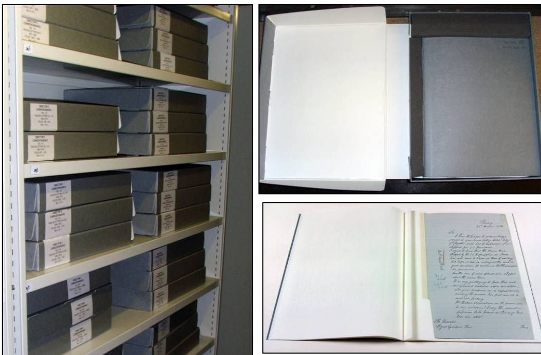
Fig. 4. Rehousing of the DC in acid free boxes with supported fascicules.