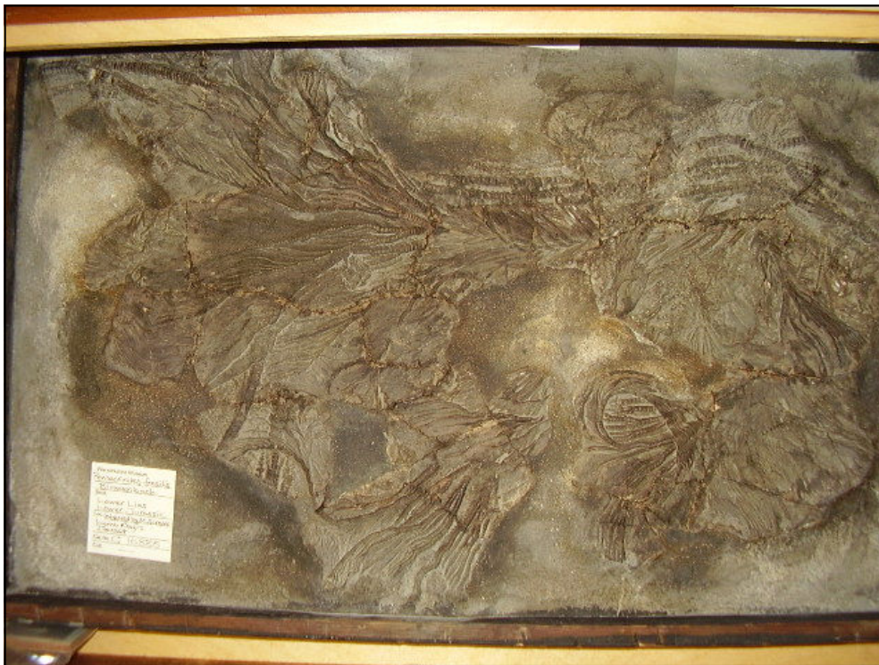
Fig. 1. Pentacrinites fossilis Blumenbach. Lower Jurassic Charmouth Mudstone Formation, West Dorset coast, England. Warwickshire Museum specimen WARMS G10385.