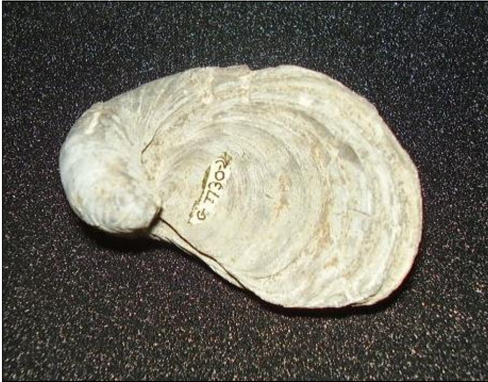
Fig. 2. Gryphaea arcuata Lamarck, showing regular (probably seasonal) growth banding on right (upper) valve. Lower Jurassic Lias Group, locality unknown. Warwickshire Museum specimen WARMS G7730/2; length of specimen is 70 mm.