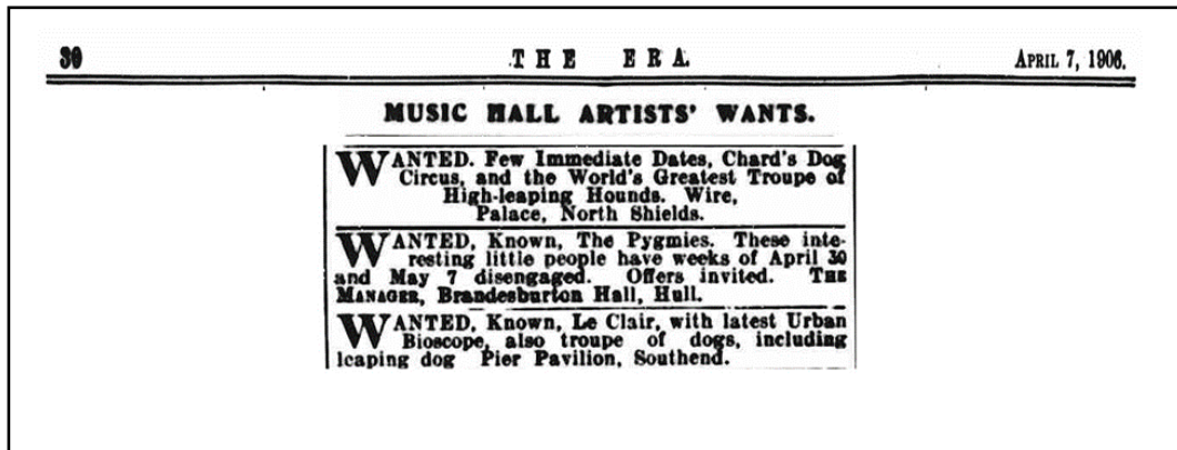
Figure 4. Classified advertisement in The Era , 7 April 1906.

had been employed by the Force Publique in the Congo in the 1890s. However, this was clearly a novelty act, as can be seen in a cutting from The Era (Anon 1906), on the 7th April 1906 looking for engagements, where they are advertised between two performing dog troupes (Figure 4).