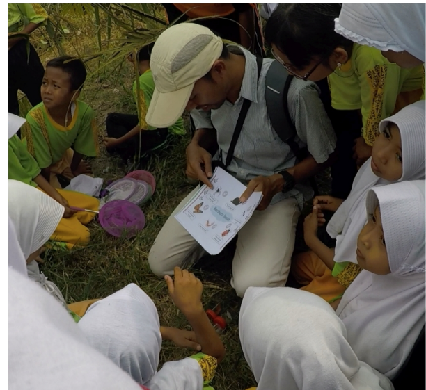
Figure 5. Children taking part in ecological jenga and insect collecting and identification activities, March 2018