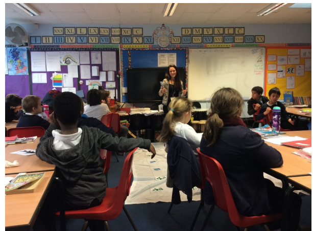
Figure 1. Year 4, St Luke's Primary during museum-led session, February 2018

The school's Year 4 students were to join us for the remainder of the project and were the first to receive the new school session developed as part of the dissemination goals (Figure 1). This session aimed to provide the children with some knowledge of the concepts we would be coming across during the project, and allow us to test our new activities in a 'real-life' environment.