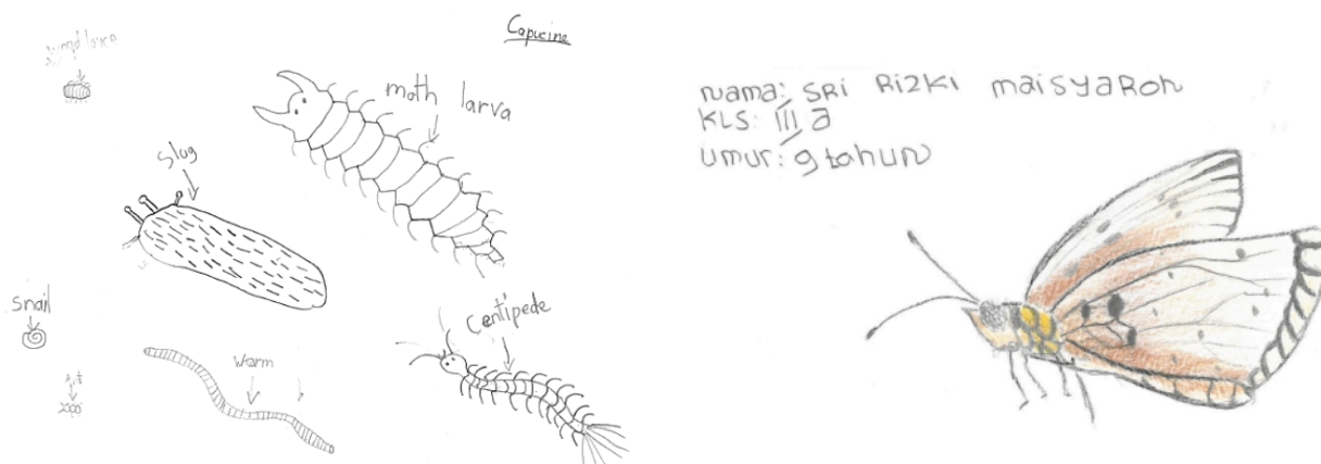
Figure 6. Drawings shared between schools in Cambridge and Sumatra, April 2018

The Across the Continents project will begin by sharing the content created as part of the schools communication project with teachers via the University Museum of Zoology website and social media platforms. Current efforts are looking to create