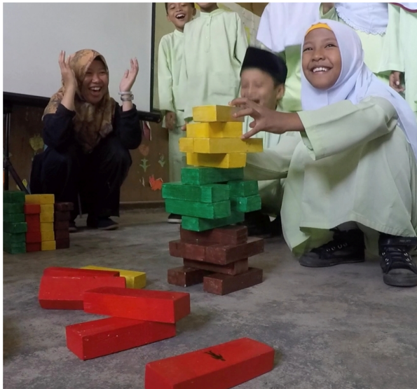
Figure 4. Participants playing habitat 'twister' to shake off afternoon fatigue, March 2018

As the training continued, we covered skills that come naturally to any museum educator. These included pitching information at the correct level for different ages and abilities, understanding how children learn through reinforced words and terms, and ensuring that sessions are made up of both energetic (Figure 4) and calm activities to aid the children's learning and concentration.