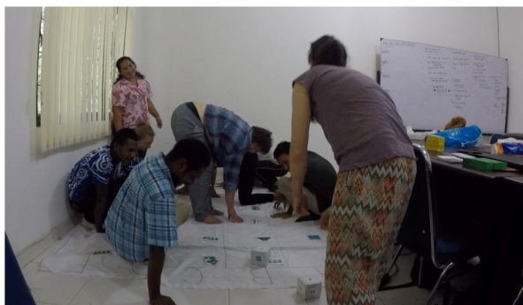
Figure 3. School session training activity, March 2018

In order for us to achieve sustainability and longevity beyond the study tour, and for the developed school session to have the widest possible scope and impact, it was important that the study tour participants acquired the skills, resources and confidence to deliver the 'habitat change' session in their local schools. We achieved this through two days of intensive training, including a number of activities and tools that many educators will have come across in their own training. We began with an activity that got the group thinking about how they would communicate their projects to anyone with a lower level of formal education or understanding of climate science (Figure 3). We talked in more general terms about how we could share the information that we learn during our research with different audiences, and underlined words that the average person may not have come across before.