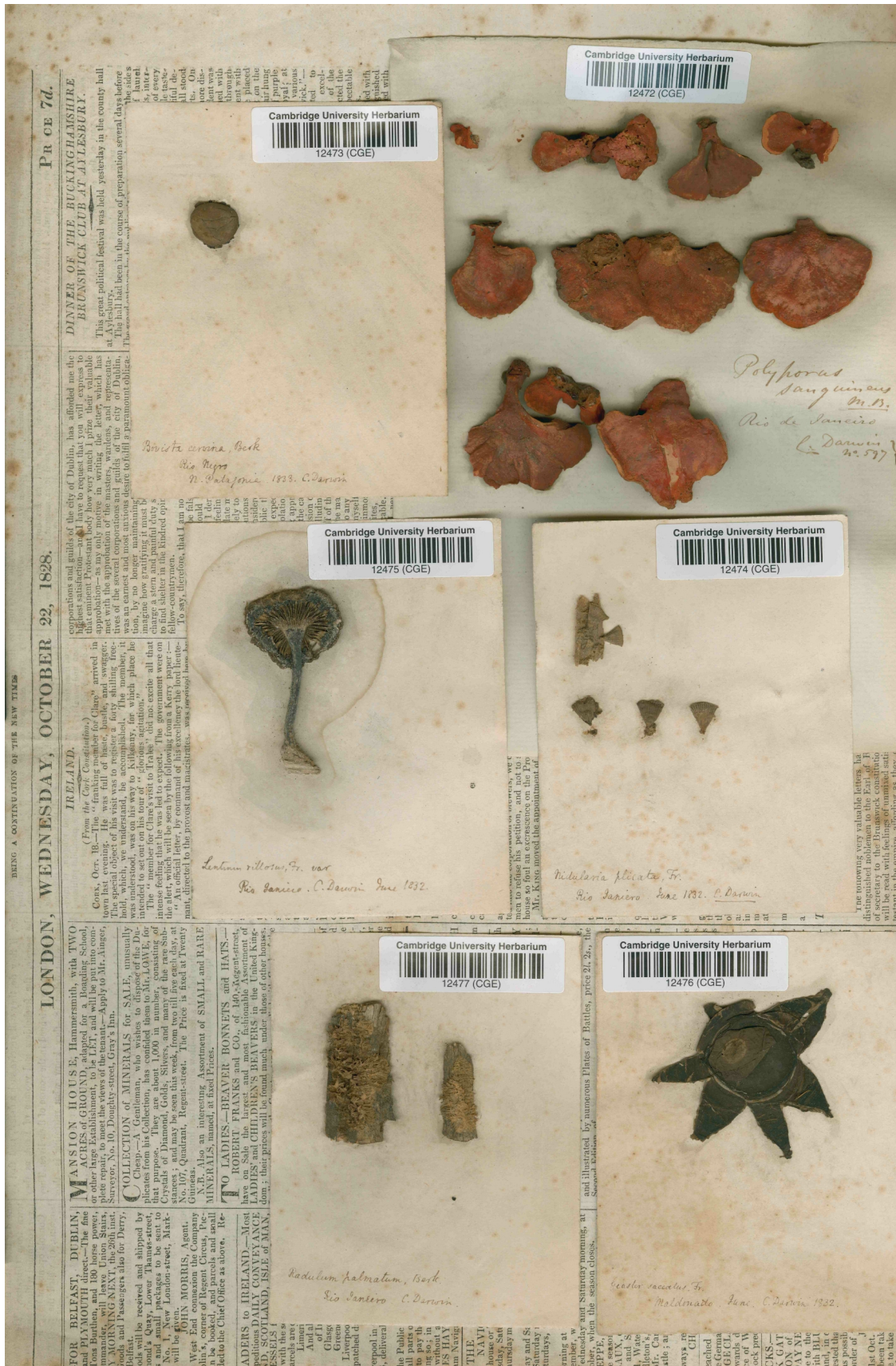
Figure 10. Fungi specimens collected by Charles Darwin on the Voyage of the H.M.S. Beagle in their original newspapers (CGE12472-124727)