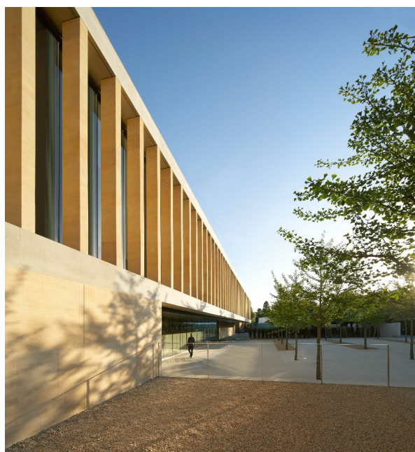
Figure 7. The Sainsbury Laboratory Cambridge University

Foundation, the SLCU is an ultra-energy efficient Stirling Prize winning building, housing state-of-the-art laboratory facilities and plant growth facilities, as well as facilities for CUBG and space for CGE in the basement of the building. A separate research institution within the University of Cambridge, research groups in the SLCU specialise in fundamental plant growth and development.