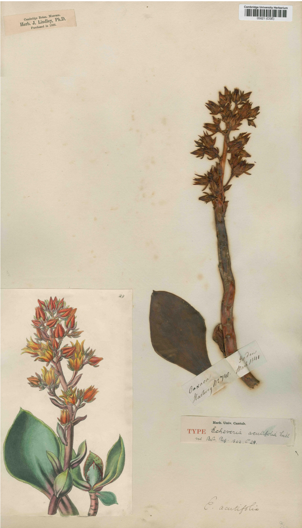
Figure 5. Echeveria acutifolia specimen collected by Carl Hartweg in 1842 © Cambridge University Herbarium (CGE05621)