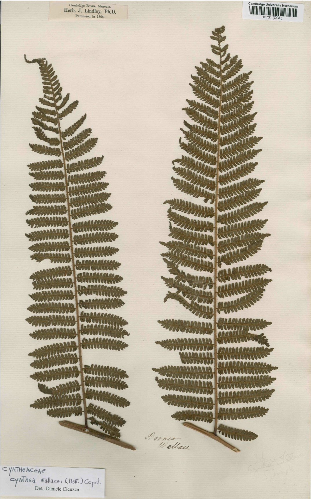
Figure 9. Cyathea wallacei specimen collected by Alfred Russel Wallace in Borneo (CGE12731)