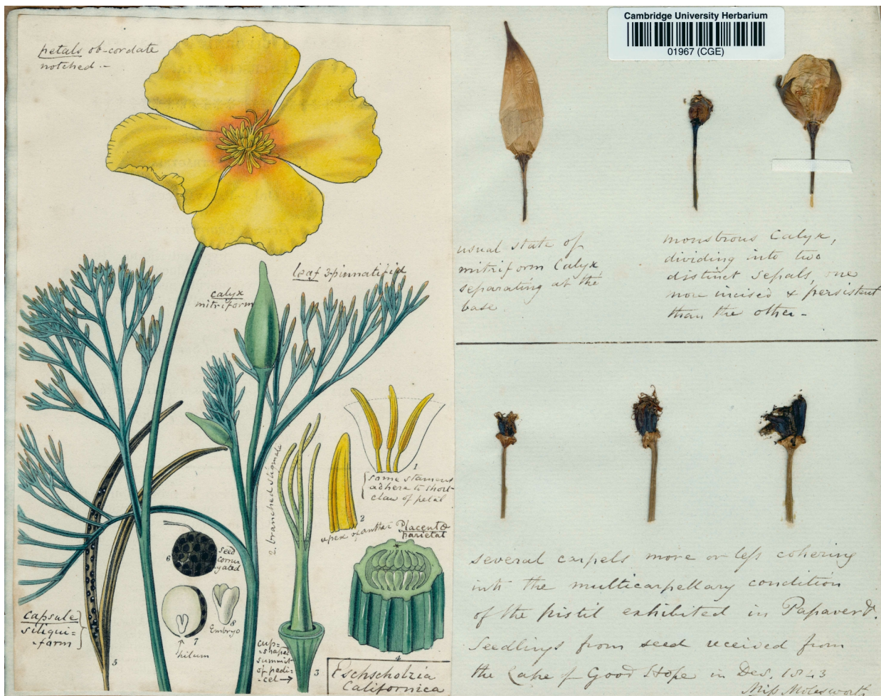
Figure 3. Eschscholzia californica specimen showing Henslow's illustration and interest in 'monstrous' forms (CGE01967)

Lemann studied medicine at Trinity College, Cambridge, and in his short lifetime travelled and collected botanical specimens in Madeira, Gibraltar, Italy, Tenerife, and Spain. He built up a collection of over 50,000 specimens, incorporating others' collections from all over the world, especially from southern Europe, North America, Brazil, Guiana, the Cape of Good Hope, and Australia. Known to be rich in type specimens, the Lemann herbarium is even more interesting on the basis that a condition of Lemann's will was that the collection be bequeathed to Cambridge - but only after George Bentham (1800-1884), Secretary of the Royal Horticultural Society 1829-1840) and later based at the Royal Botanic Gardens, Kew, was allowed to name and arrange it first. Bentham spent much of the next seven years mounting, naming, arranging – and adding to – the collection. In 1860, the collection came to Cambridge