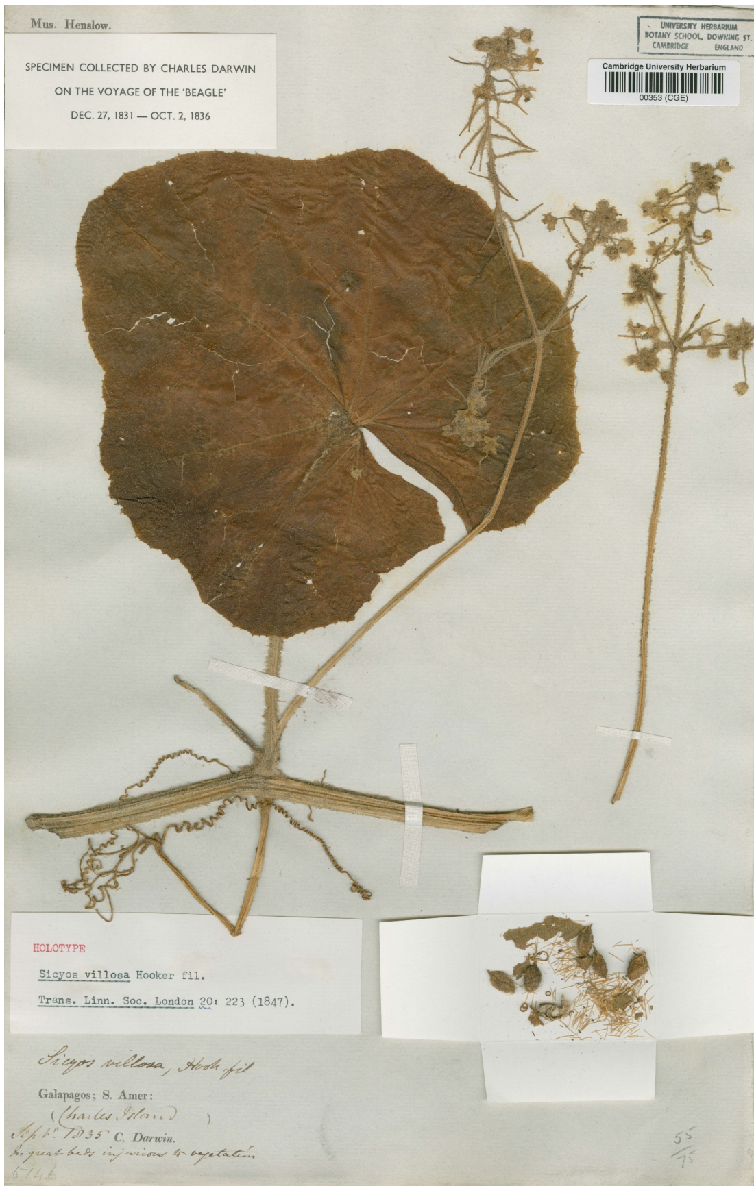
Figure 4. Sicyos villosa specimen collected by Charles Darwin in 1835 © Cambridge University Herbarium (CGE00353)