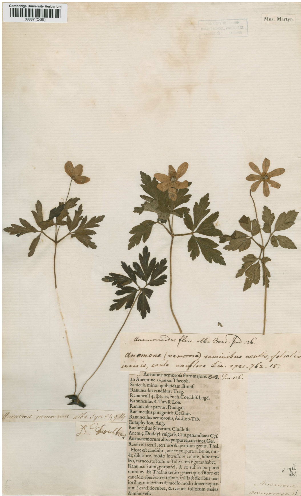
Figure 1. Anemone nemorosa specimen in Martyn herbarium (CGE08887)