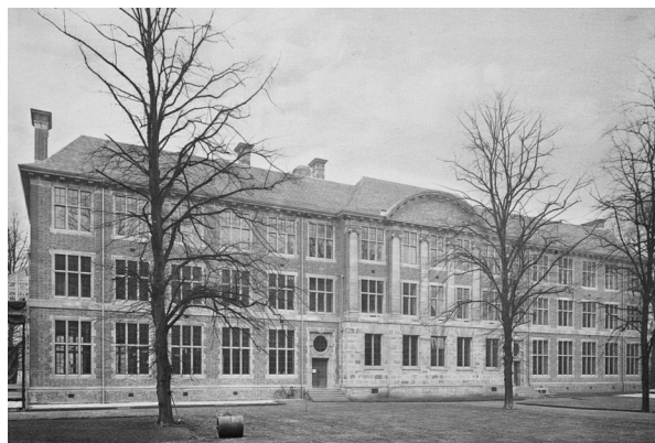
Figure 6. Botany School, University of Cambridge, 1904

In 1895, after the death of Babington, the chair of the Botany School in Cambridge was awarded to a student of Thomas Huxley, Harry Marshall Ward (1854-1906), father of the botanist and explorer Frank Kingdon-Ward. Marshall Ward oversaw the building of a new Botany School building, on the Downing Site in central Cambridge (Figure 6), opened by King Edward VII and Queen Alexandra on 1 March 1904. The herbarium was moved to occupy a purpose-built space on the ground floor of the new state of the art steel-framed building.