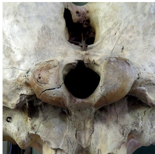
Figure 7. The rear of the elephant skull (UMZC.H.4611) showing substantial cracks around the occipital condyles that have left the skull weak and vulnerable to further damage.