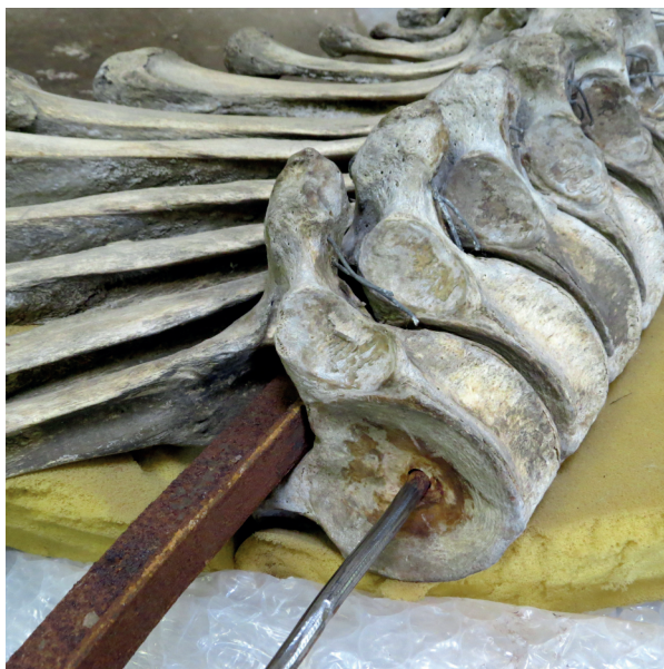
Figure 6. The rusty T-shaped vertebral bar with some of the vertebrae still attached. The thin vertebral rod has been cleaned in an attempt to remove it from the vertebral centra.

Five of the eight small brackets that hold the lower limb bones to the upper limb bones were missing, and had to be made using a forge, anvil, hammers, and angle grinder (Figure 10). Some of the threaded