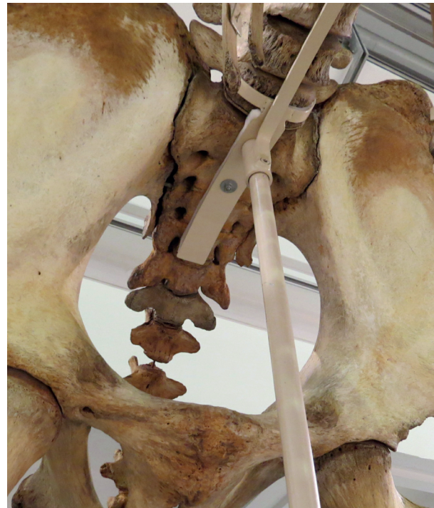
Figure 9. The steel support for pelvic region: the vertical rod on the underside inserted into the top of the rear upright support; and the upper surfaces of the metal bracket are lined with white inert Plastazote foam under the bones.

bars that had been inserted into the ends of the limb bones for attachment to the brackets were missing, and some were present but bent. Therefore, some had to be bent back into position and others replaced.