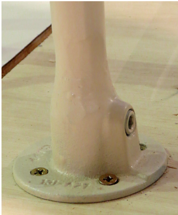
Figure 8. A steel floor plate welded to the bottom of one of the upright steel tubular supports, within which a 22mm diameter threaded bar is welded. This bar runs through the wooden base and is secured underneath with nuts and spring washers. Image: Nigel Larkin.