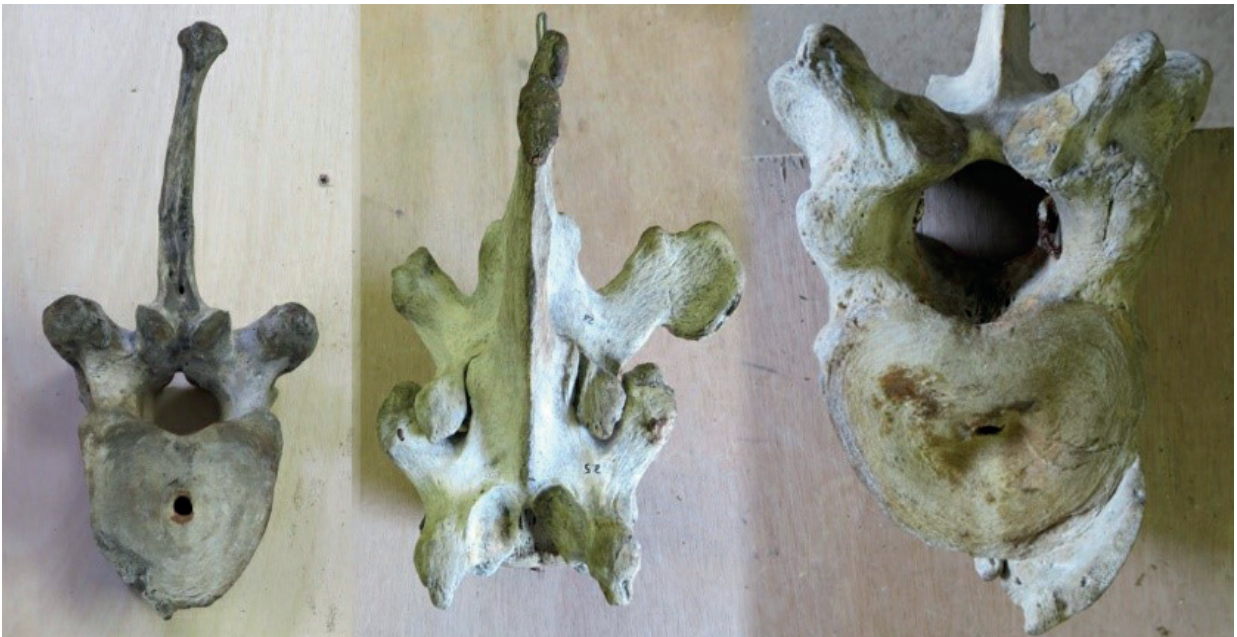
Figure 4. Pathologically deformed vertebrae of the Asian elephant skeleton (UMZC.H.4611): two asymmetrical vertebrae and on the far right a vertebra with a bony overgrowth ventral to the centrum.