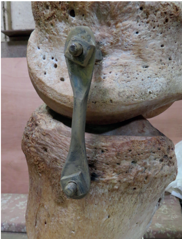
Figure 10. One of the five brackets made on the forge to hold the lower limb bones in articulation with the upper limb bones.