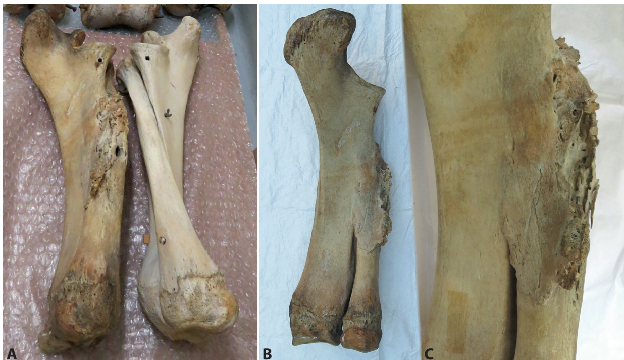
Figure 2. A. The radius and ulna of both of the forelimbs of UMZC.H.4611, showing the pathologically deformed left radius and ulna to the left of the image clearly different to the right radius and ulna on the right of the image; B. the fused left radius and ulna, showing the area of deformed bone; C. a close-up of the diseased area of the left ulna.

The skeleton was dirty from being in storage for 50 years, most recently laying uncovered on open racking. Many bone surfaces were sticky with residues of natural oil, and therefore dust and dirt had adhered to these areas, turning them black over time.