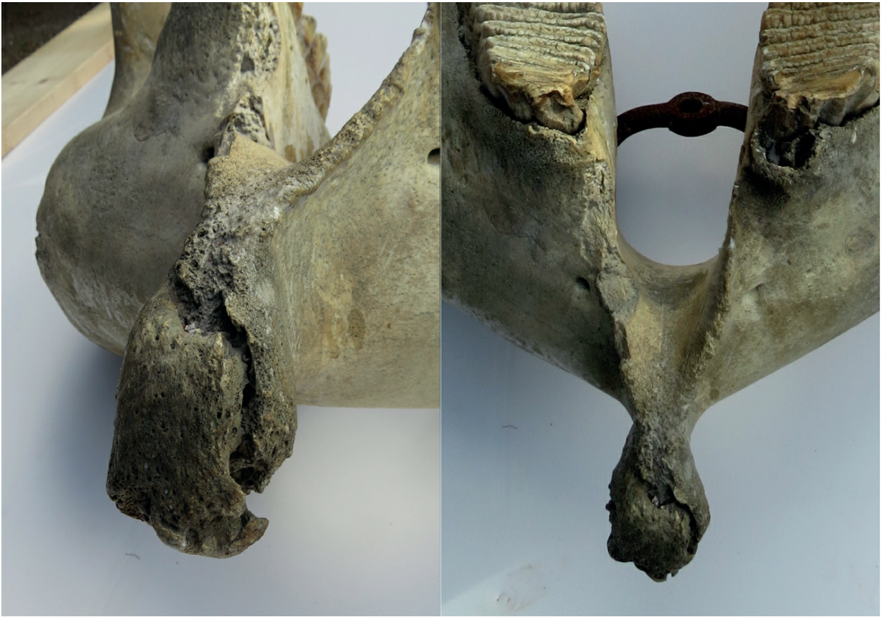
Figure 3. The pathologically deformed symphysis of the mandible of UMZC.H.4611.