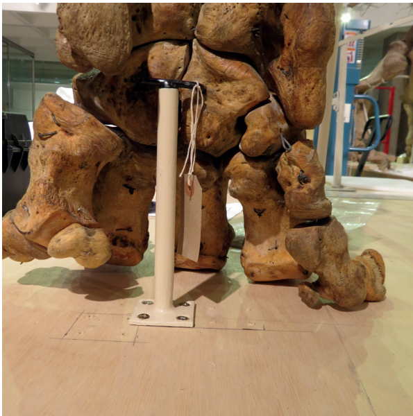
Figure 11. One of the four supports made for the feet: a steel tube welded to a base plate with screw holes, so it can be secured to the wooden base.

the anterior-most pieces were not too curled, and this enabled most of the sternum bones to be re-attached with the appropriate pieces of cartilage in place, using thin steel wire running through the old holes.