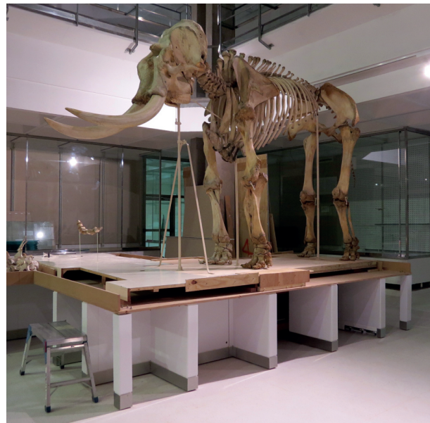
Figure 12. The Asian elephant skeleton (UMZC.H.4611) installed on the high plinth, in the gallery still undergoing refurbishment.

was taken off the display plinth and put back on to the floor, and the ribcage was manoeuvred into position using the two stackers to lift either end of the metalwork. Once the ribcage was secured to the upright supports, the stackers were lowered and used to pick up the wooden base at either end. The wooden base, with the metal supports and ribcage in place, was then raised just above the display plinth and carefully slid into position. All the limb bones were mounted to provide stability to the skeleton before the skull was mounted. To undertake this, surplus wooden crates were covered with Plastazote foam and carefully secured to the stacker platform to make up the height required to get the heavy skull into position. The skull was lifted manually onto the crates on the stacker, and was secured in place temporarily with straps. It was lifted into position and secured on its supporting mount with its original metal hook. Once the skull was secure, the mandible, tusks, and tail were secured in place (Figure 12). The murderous 'Yatiantota Tusker', the " notorious and proscribed rogue " once more dominated the museum.