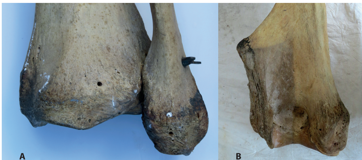
Figure 5. Examples of how dirty the bones of UMZC.H.4611 were before cleaning A. Paint and chalk marks etc on very dirty limb bones. B. A humerus mostly cleaned but the lower left section still dirty.

Whilst dry methods of cleaning bone (such as smoke sponges and 'groom sticks' made of natural rubber and air) are less invasive than wet methods, they may not clean a specimen as effectively, especially if the bone surfaces are rough, like those of an elephant bone. There is a small element of risk to the process: even though the area cleaned is 'rinsed' with deionised water a couple of times immediately after applying the detergent, there is no guarantee that the detergent will be entirely removed. Also, multiple applications of water over a period of time can damage molecular bonds within bone and ultimately exacerbate deterioration. However, a wet cleaning