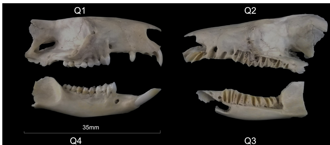
Figure 2. The skull of Trichosurus vulpecula (Kerr, 1792) arranged into quadrants before restoration.

The mandible was typically diprotodont with a large procumbent incisor, and the I-premolar + 4-molar arrangement of the posterior teeth was typical of marsupial dentitions such as those of opossum, cuscus, kangaroo, and wallaby (Tomes, 1923). The upper anterior dental arcade, with three strongly curved incisors followed by two widely spaced unicuspid teeth (C and P 1 ; see Table 1), is typical for the koala and for the Phalangeridae group of opossums and cuscuses.