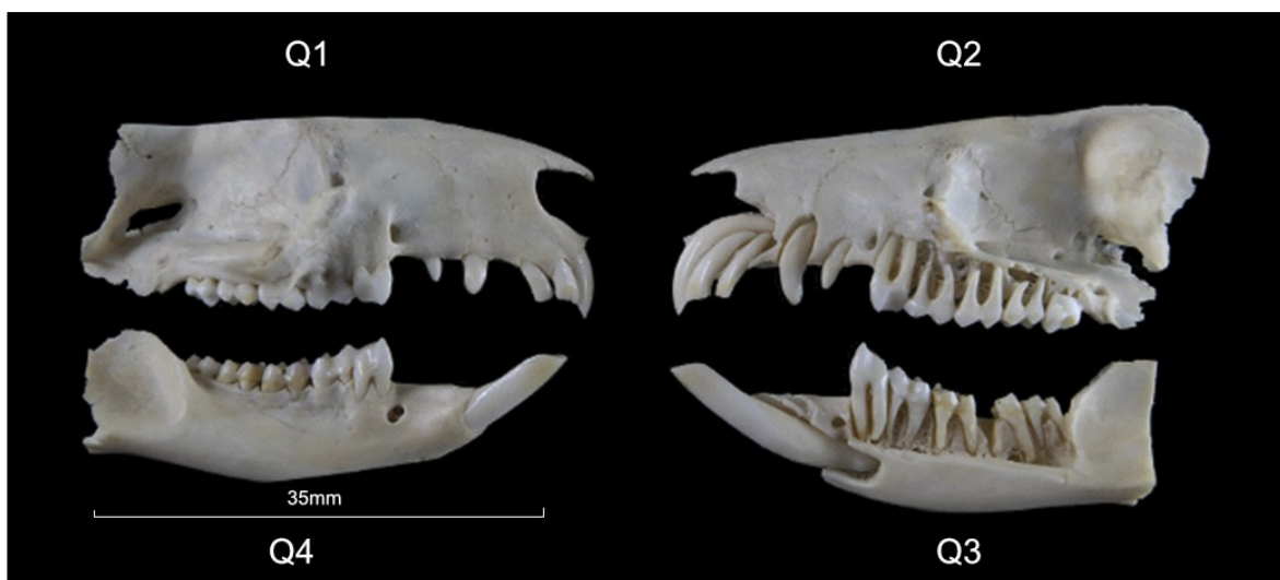
Figure 4. The completed quadrants of Trichosurus vulpecula . (Quarters numbered using ISO3950/FDI nomenclature, ISO 2016).

All four quadrants of the third specimen were found over time: first a skull and mandible pair, then a skull quadrant, and finally a loose mandible; each matched successively with the rest. Most teeth were present, and there was no conservation required beyond finding all four quadrants (Figure 5). The few missing teeth have not yet been located. Without doubt, these are the most ornate set of teeth in the collection but also the strangest. The specimen was donated in 1904 and is listed in our records as Galeopithecus volans , a species name that is no longer in use.