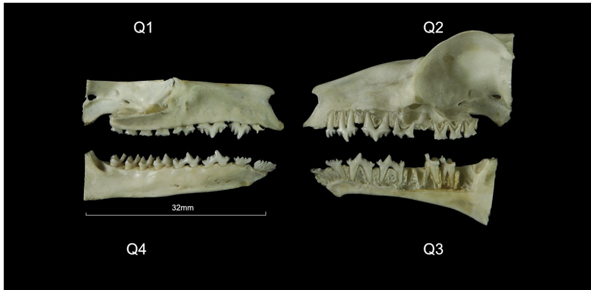
Figure 5. Two half skulls of Cynocephalus volans (Linn., 1758) (left) and Galeopterus variegatus (Audeb., 1799) (right).

The dental formula for the extant Dermoptera is (Berkovitz and Shellis, 2018; Stafford and Szalay, 2000):