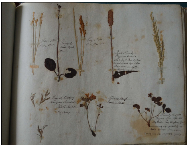
Fig. 3. (Top) A sheet from the herbaria with the loose specimens and dirt covered paper. Note the loose specimens have accumulated towards the centre of the album. (Bottom) The same sheet after conservation. Where possible specimen have been reattached to their original places.