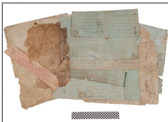
Fig. 1. The front of the bound herbarium (left), with the word 'KLUK' written. Right shows the poor condition of the loose pages.